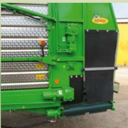
HYDRAULIC GEAR BOXEX AND MOTORS