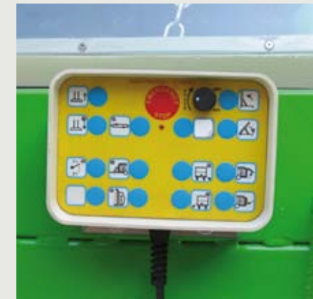
ELECTRONIC BOARD WITH SPEED CONTROL SYSTEM FOR THE UNLOADING CONVEYOR BELT AND EMERGENCY STOP BUTTON