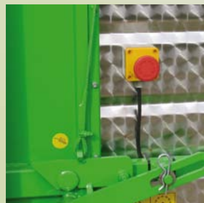
AUTOMATIC RELEASE EMERGENCY BUTTON