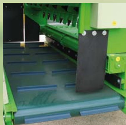
CONVEYOR BELT WIDTH: 750 mm