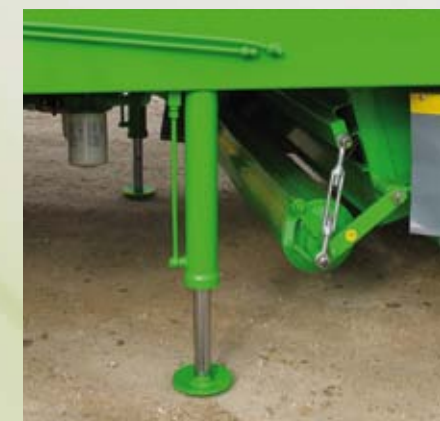
HYDRAULIC FEET BRACKET AND REAR LADDER ROLLER