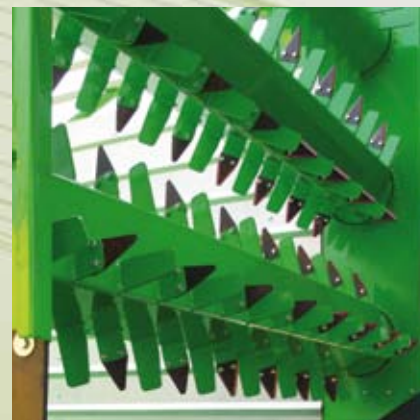
SHAPED SQUARE ROLLS