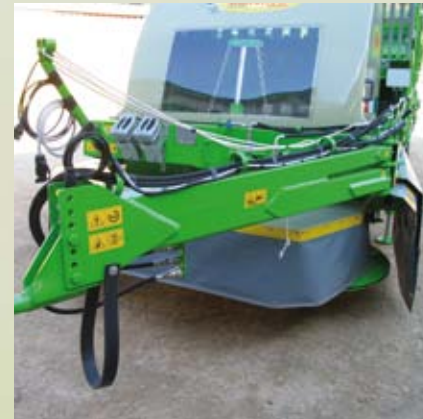
DOUBLE DRAWBAR REINFORCED FRAME