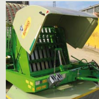
FIBREGLOSS BODY WITH WINDOWS TO ACCESS THE GRASS ELEVATOR