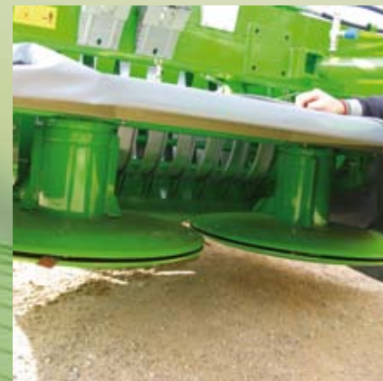
2,15 DRUM MOWER