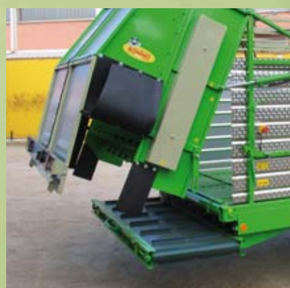
BACK HYDRAULIC UNLOADING DOOR AND UNLOADING RETRACTABLE BELT