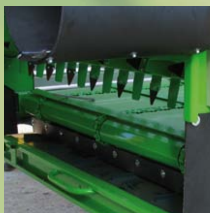
RETRACTABLE SIDE CONVEYOR BELT