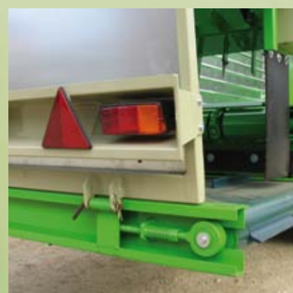
CONVEYOR BELT WITH CONTROL TENSION DEVICE