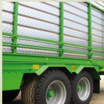
STAINLESS STEEL SIDERAILS STAINLESS STEEL OIL TANK, BED FLOOR AND SUMP ON